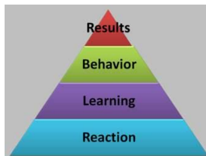
Figure 2. Kirkpatrick's Evaluation Model