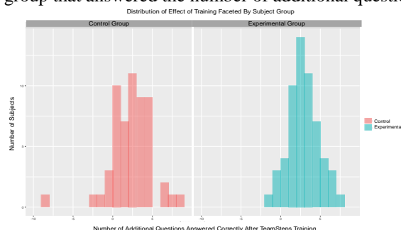
Figure 3. Change in Subjects’ Scores from Pre to Post Test – Preliminary Study

To answer this question, we conducted a preliminary study using 114 subjects split into two groups: (1) a control group who was taught via traditional methods and (2) an experimental group that was taught TeamSTEPPS® concepts via our avatar-guided simulation-based training. Within our study, 56 subjects were assigned to the control group; and 58 subjects were assigned to the experimental group. This preliminary study was followed by the full study using our full complement of students. Before undergoing training, the subjects in each group took a pre-training validated concept knowledge test containing 23 questions to assess their knowledge of the TeamSTEPPS® protocol. After completing the pre-test, traditional didactic TeamSTEPPS® training was administered to this control group; and avatar-guided simulation-based training was administered to the experimental group. Once training was completed, the knowledge of the subjects was assessed again via a post-training test containing the same 23 questions as the pre-test. The change in the subjects’ scores from the pre-training test to the post-training test is shown in Figure 3. Figure 3 reflects a histogram where the y-axis denotes the number of subjects within a given group that answered the number of additional questions correctly that is shown on the x-axis.